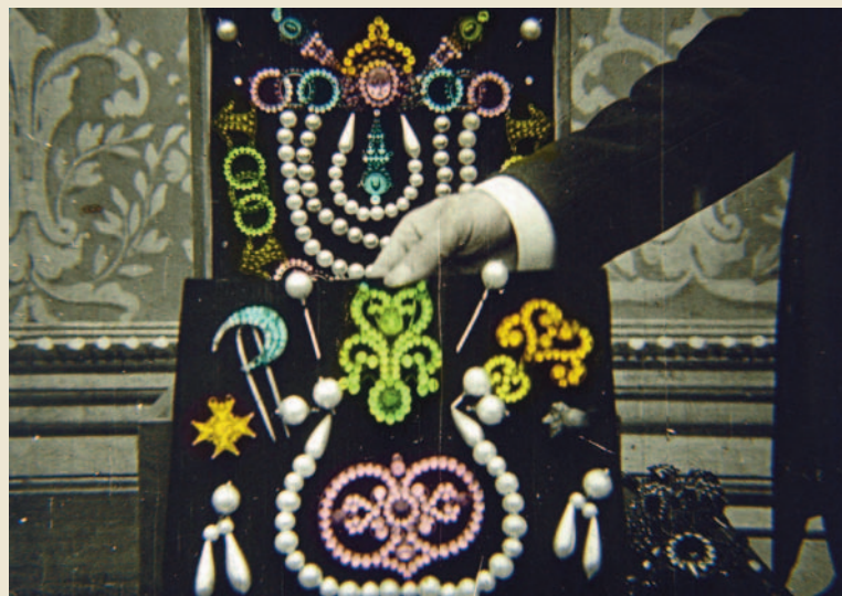
La fée aux fleurs , Pathé, 1905; Voleurs de bijoux mystifiés , Pathé, 1906.