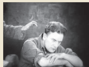
The Canadian , William Beaudine, 1926.