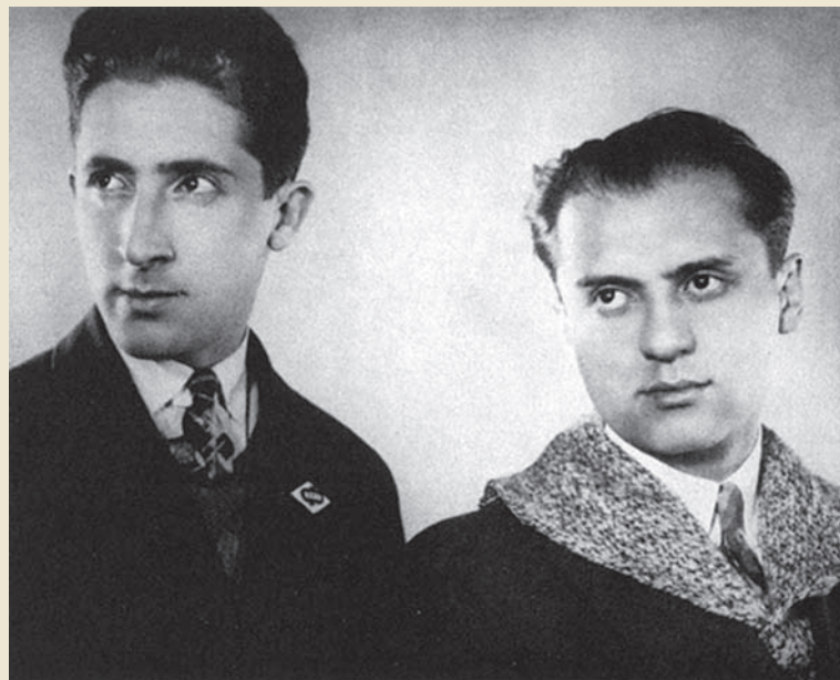
Grigori Kozintsev, Leonid Trauberg.