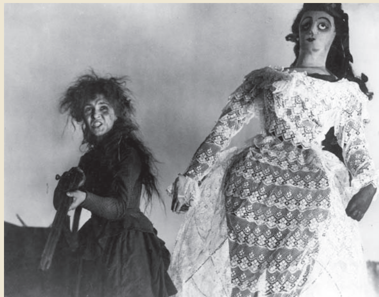
Novy Vavilon , Grigori Kozintsev, Leonid Trauberg, 1929.