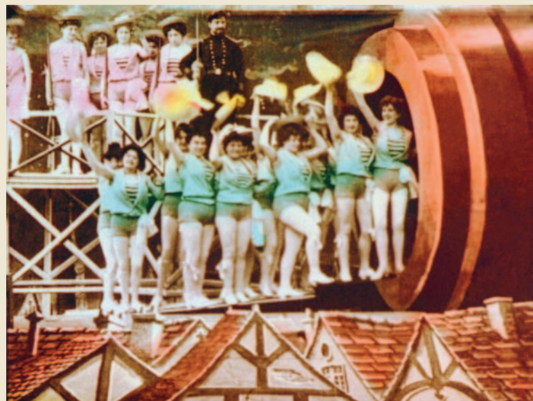
Le voyage dans la lune, Georges Méliès, 1902.