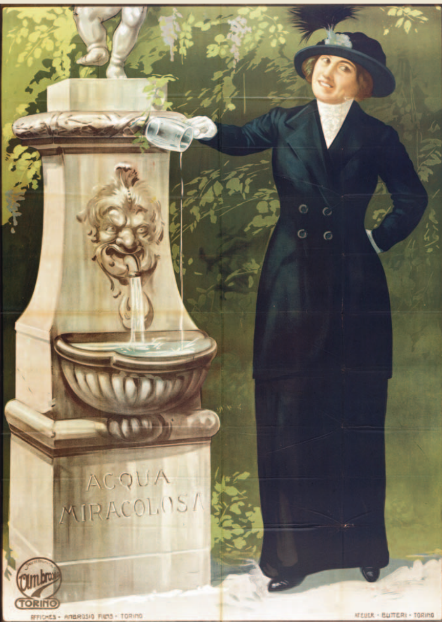
Le acque miracolose , Eleuterio Rodolfi, 1914.